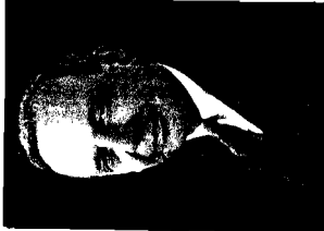
CHARLES E. MERRIAM

The first phase of the democratic effort is ordinarily that of overthrowing vested interests of one type or another — land, heredity, arms, wealth — and establishing a sound democratic regime. The second stage is more difficult, for it involves the continuance of the democratic attitude and process under new conditions. The problem becomes not